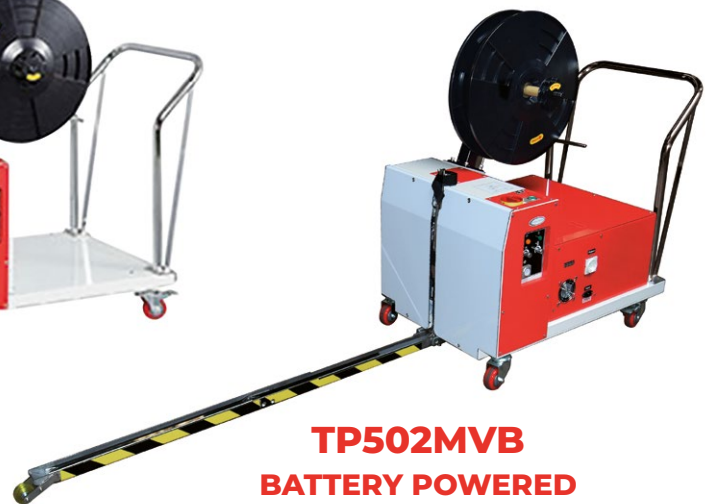
TP502MVB BATTERY POWERED