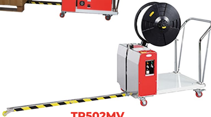
TP502MV 220 V POWER SUPPLY