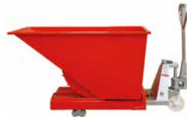
Hand operated with pallet truck: up to 1600l