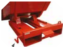
Manual or automatic trigger from the forklift truck with a chain or cable pull