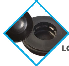
REINFORCED WHEEL LOCK