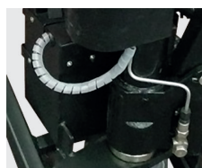
Protected hydraulic system