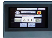
LED panel control