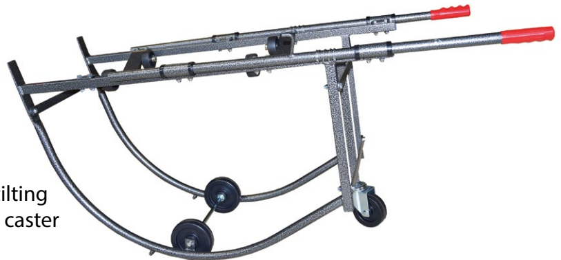
Four rollers for drum rotation