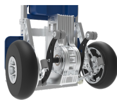
Equipped with a brake