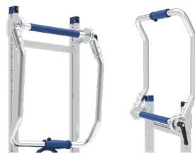
Tilt handle, 360° swivel