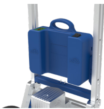
Removable lithium battery