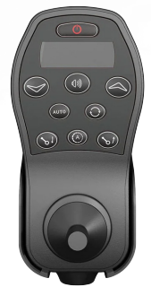
All in one wire controller